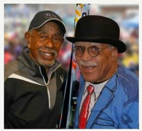
HALL OF FAME INDUCTION Ben Finley & Art Clay First African Americans to be inducted into the U.S. Ski & Snowboard Hall of Fame